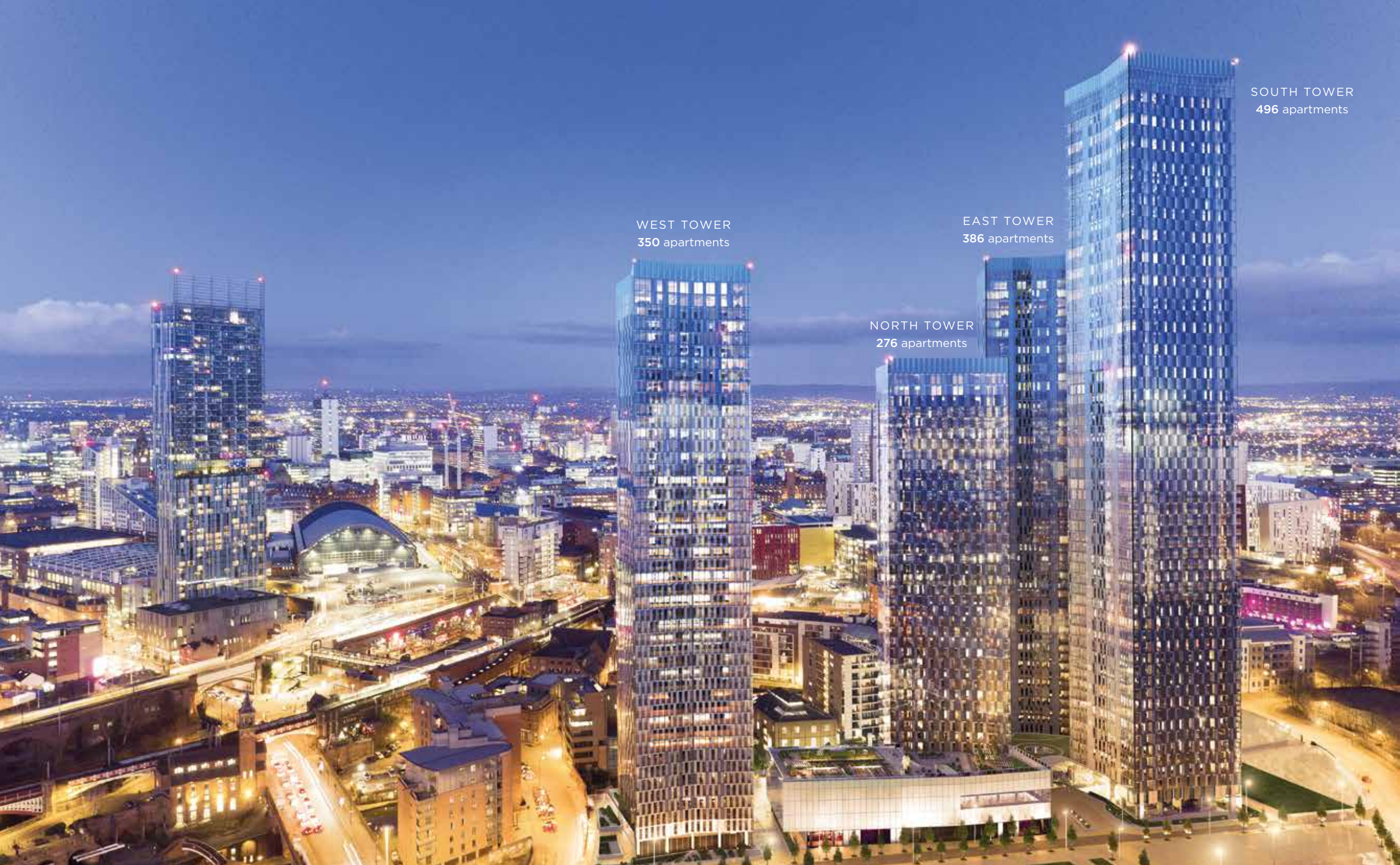
WEST TOWER 350 apartments