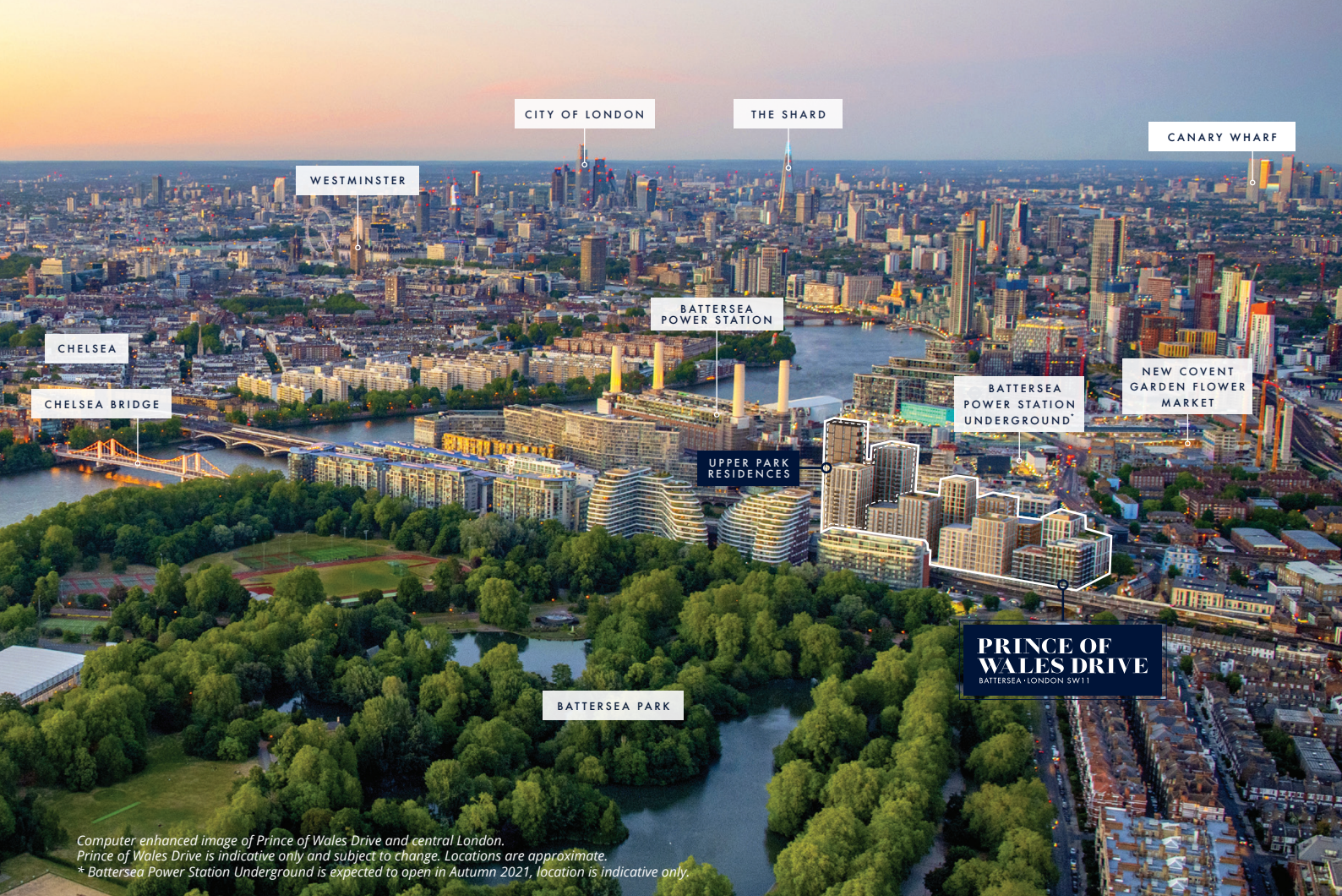
Computer enhanced image of Prince of Wales Drive and central London. Prince of Wales Drive is indicative only and subject to change. Locations are approximate. * Battersea Power Station Underground is expected to open in Autumn 2021, location is indicative only.