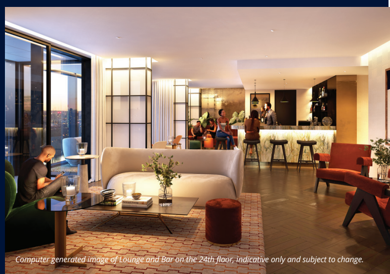
Computer generated image of Lounge and Bar on the 24th floor, indicative only and subject to change.