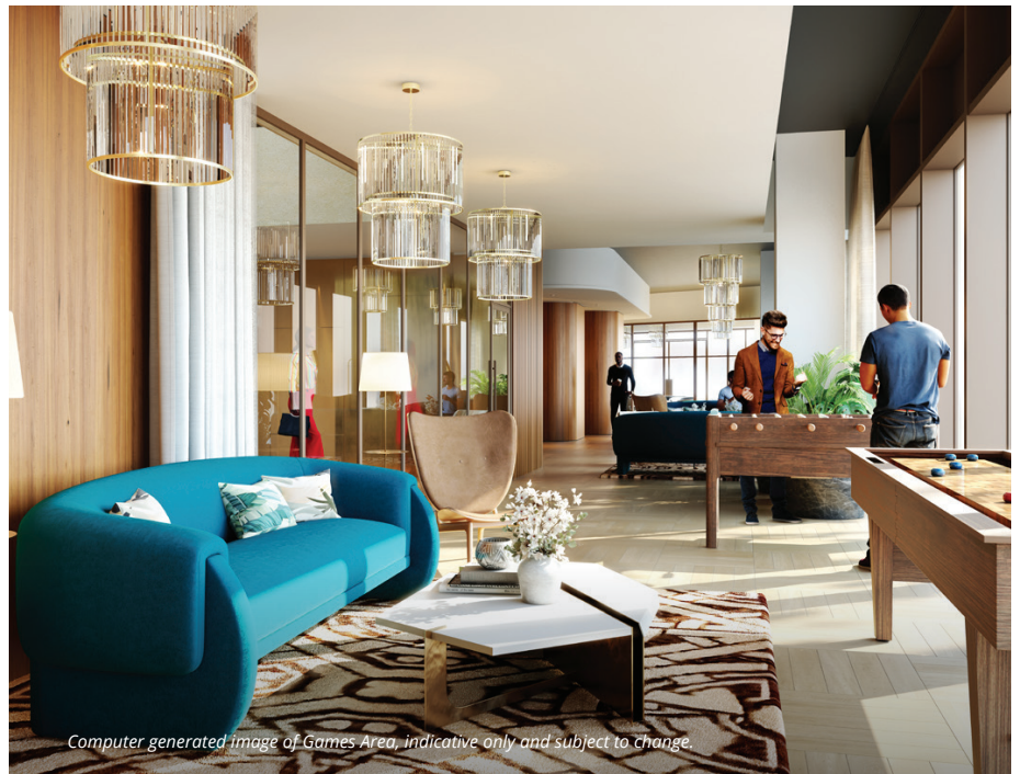
Computer generated image of Games Area, indicative only and subject to change.