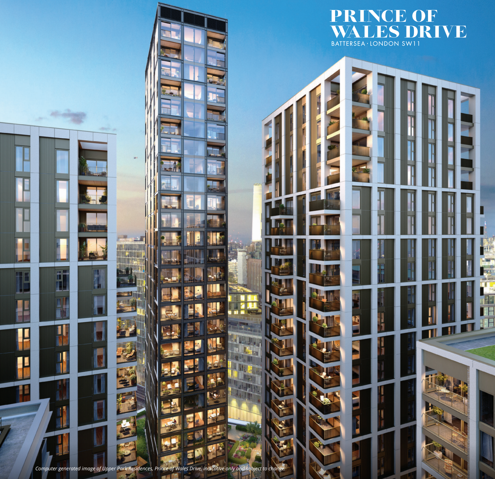
Computer generated image of Upper Park Residences, Prince of Wales Drive, indicative only and subject to change.