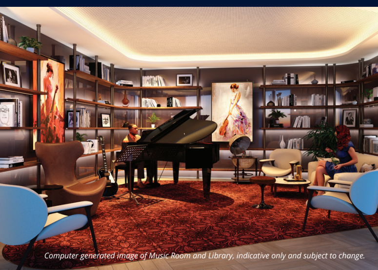
Computer generated image of Music Room and Library, indicative only and subject to change.